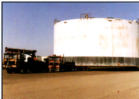
Storage Tank Relocation