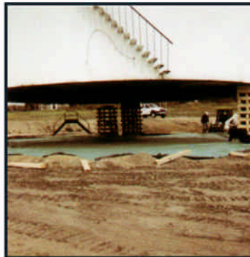
Release Prevention Barrier Installation