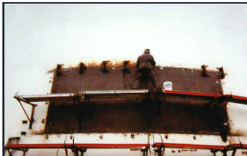
Shell Plate Replacement